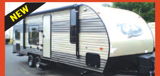
2019 Cherokee Grey Wolf 26DJSE Travel Trailer Power jack, sleeps 9. MSRP $24,238. SALE PRICE $16,495 AS LOW AS $144 A MONTH

MONDAY – FRIDAY 9:00 – 5:30 | SATURDAY 9:00 - 2:00 | SUNDAY: CLOSED CLOSED MEMORIAL DAY