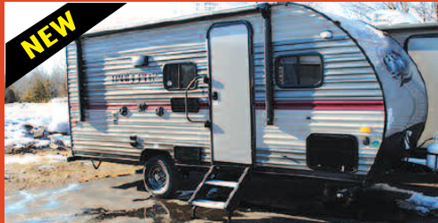
2018 Cherokee Wolf Pup 16 BHS Travel Trailer Bunkhouse sleeps 5. MSRP $19,992. BLOWOUT PRICE $10,995 AS LOW AS $119 A MONTH