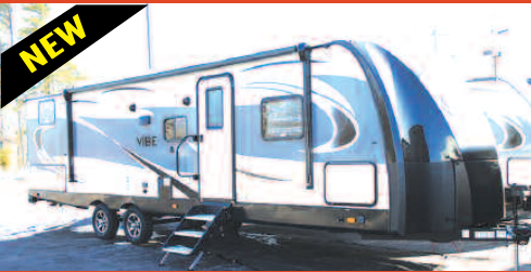
2019 Vibe 284 BHS Travel Trailer Power jack, slideout, power awning. MSRP $38,982. SALE PRICE $29,900 AS LOW AS $229 A MONTH