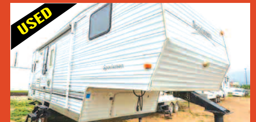
2002 KZ Sportsmen 2452 Fifth Wheel. Regular $5,995. SALE PRICE $4,995 AS LOW AS $89 A MONTH