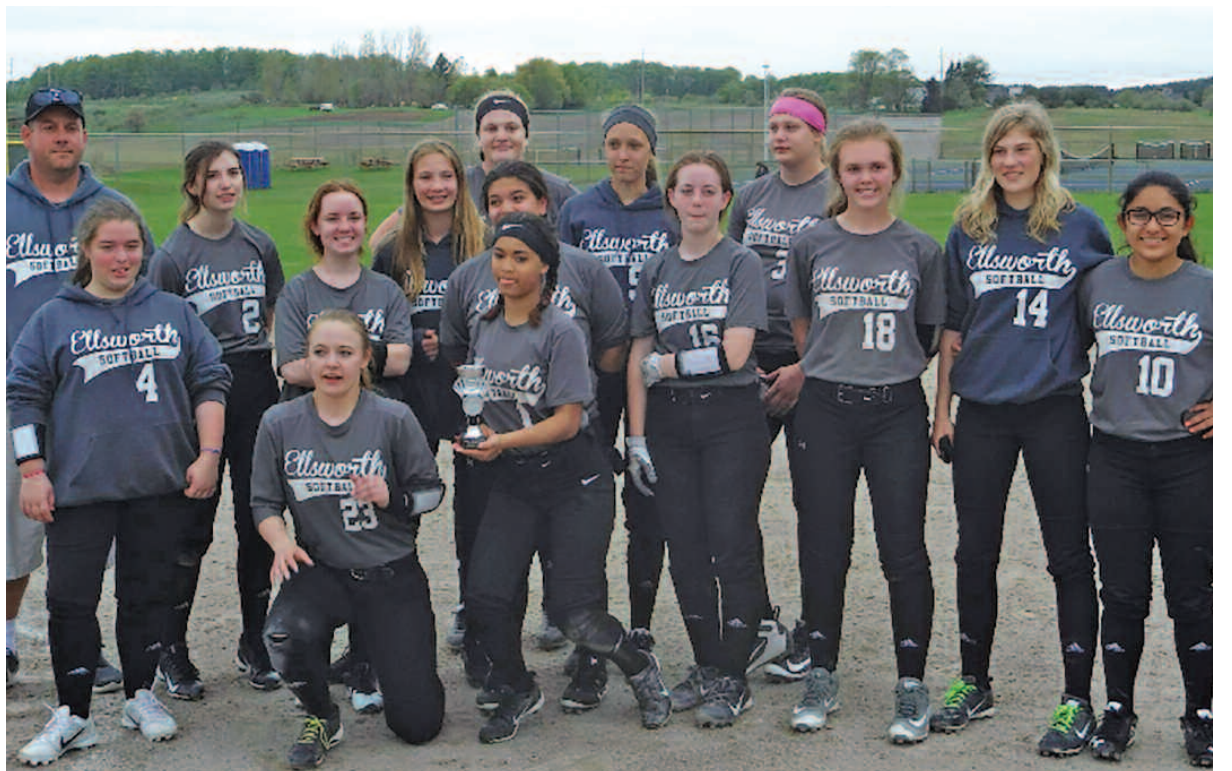
The Ellsworth softball team poses with their runner-up trophy, following the Traverse City Invitational on May 19.