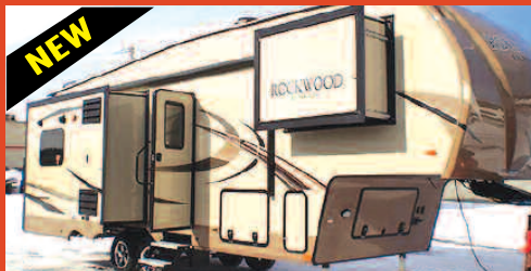
2018 Rockwood Ultra Lite 2650 WS Fifth Wheel 3 Slideouts, gas grill, rear entertainment area has facing slideouts for extra space. MSRP $40,131. SALE PRICE $33,900 AS LOW AS $249 A MONTH