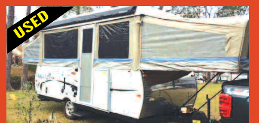
2012 Flagstaff High Wall HW27SC Pop-Up Camper Slideout. Regular $11,995. SALE PRICE $10,995 AS LOW AS $119 A MONTH