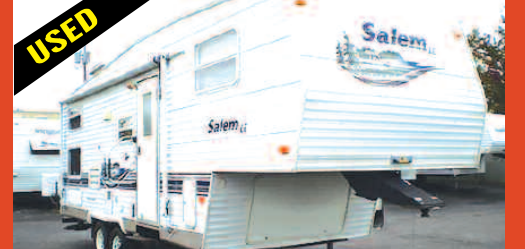
2004 Salem 24BH 5th Wheel Bunkhouse, Slideout. Regular $8,995. SALE PRICE $6,995 AS LOW AS $99 A MONTH