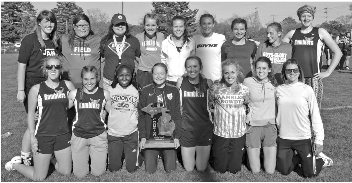
Boyne City girls track and field team pose with their first ever Regional trophy.

The Ramblers won eight events and qualified in 11