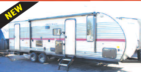
2018 Cherokee Grey Wolf 26 DBH Travel Trailer Bunkhouse, slideout. MSRP $26,895. SALE PRICE $19,995 AS LOW AS $199 A MONTH